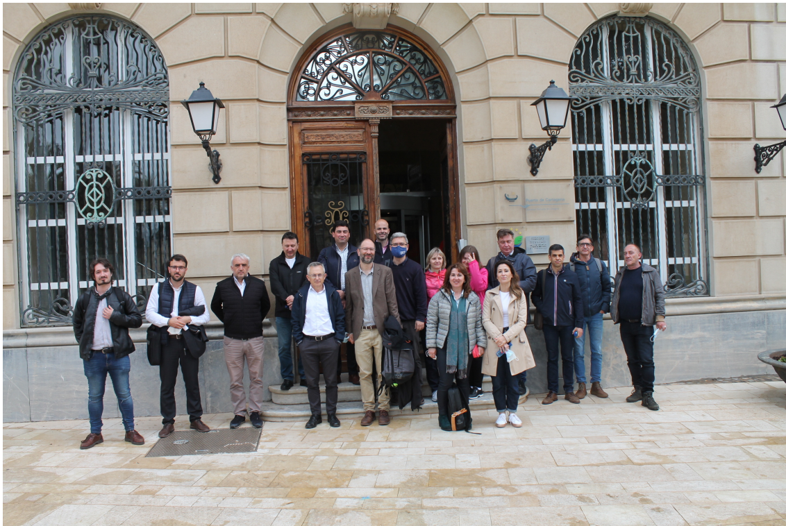
Partners of the Bimvet3 project at the venue of the port authority of Cartagena.

The partners that make up the consortium have met in person for the first time in person. We have gathered in Cartagena for our "Learning Activity" and our first physical transnational meeting. The events were mainly organised on the facilities of the coordinating organisation UPCT.