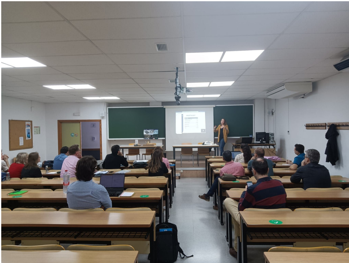
Bimvet3 transnational meeting in the facilities of the UPCT (Cartagena/Spain).

From this official Newsletter of the Bimvet3 project, we would like to thank the following for their selfless participation as speakers: